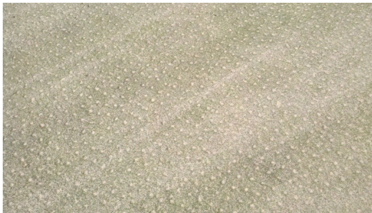
An aerified and topdressed green.

Below normal temperatures are still forecasted for the next few weeks so it is important not to get too excited for spring to come rushing out of the gates. The turf will heal over from aerification and provide a great basis for a healthy golf course this season. Improvements will also continue on the Driving Range as the grass continues to grow and we are able to carve out a target fairway. As golf play increases however, please remember to fix your ballmarks on the greens. As the Green Department continues to focus on keeping the divots filled with healthy soil and bentgrass seed, we will simply ask